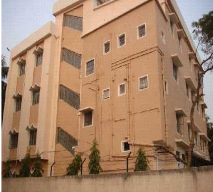
The college building